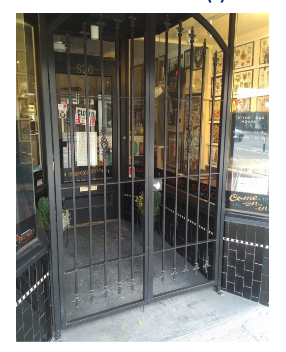
Fixed Gate with Ornate Details (L) and Plain Bars Installed over Door (R):