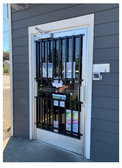
Retractable Grill with Hidden Box (L) and Fixed Gate with Plain Detailing (R):